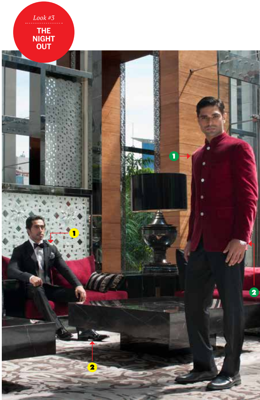
Look #3 THE NIGHT OUT

2 Dual coloured gold and silver watch by VERSACE.